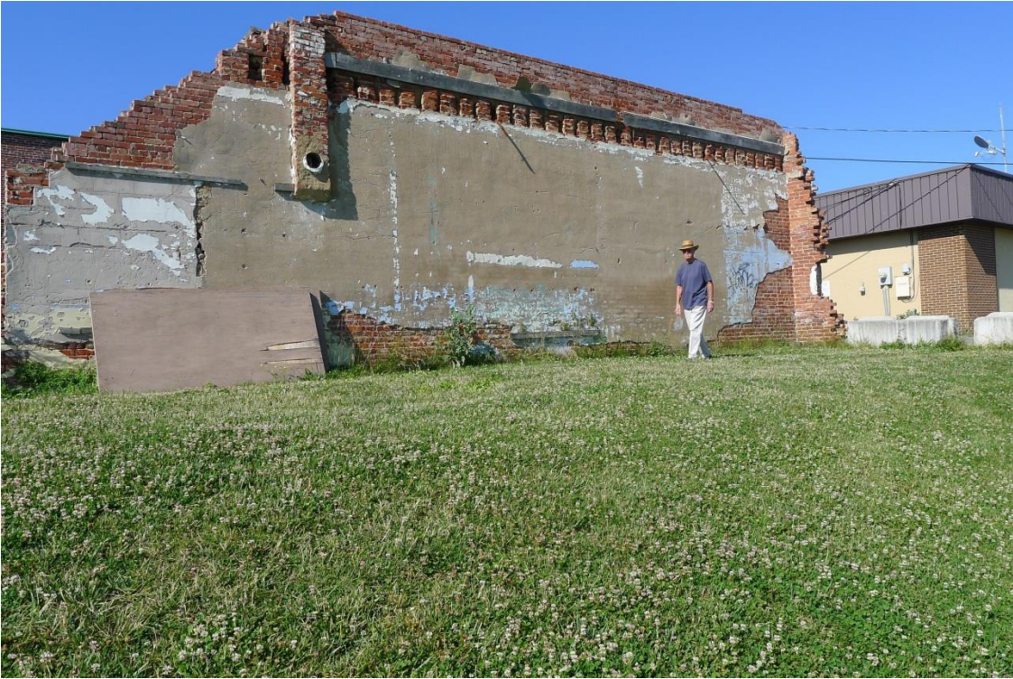
PHOTOGRAPH OF POTENTIAL MURAL WALL