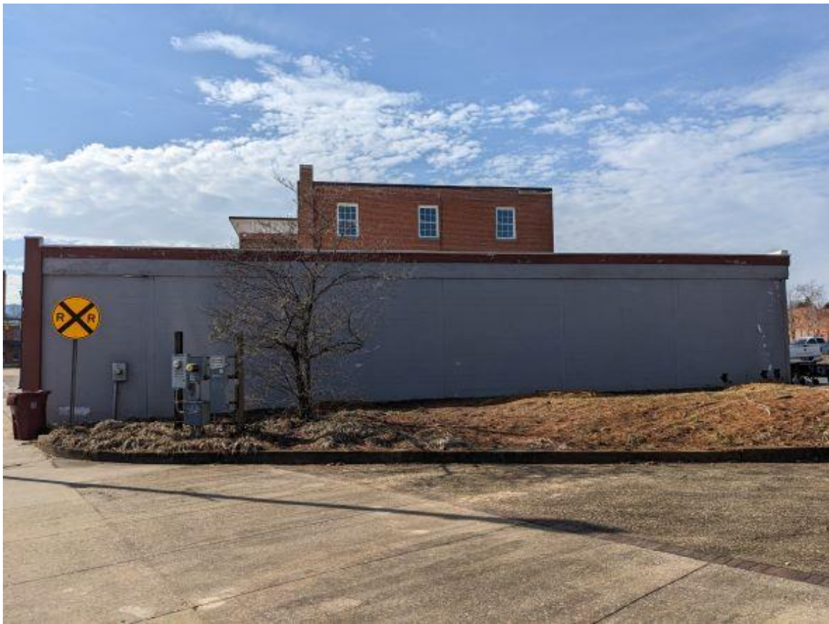
(Lower Wall Only)