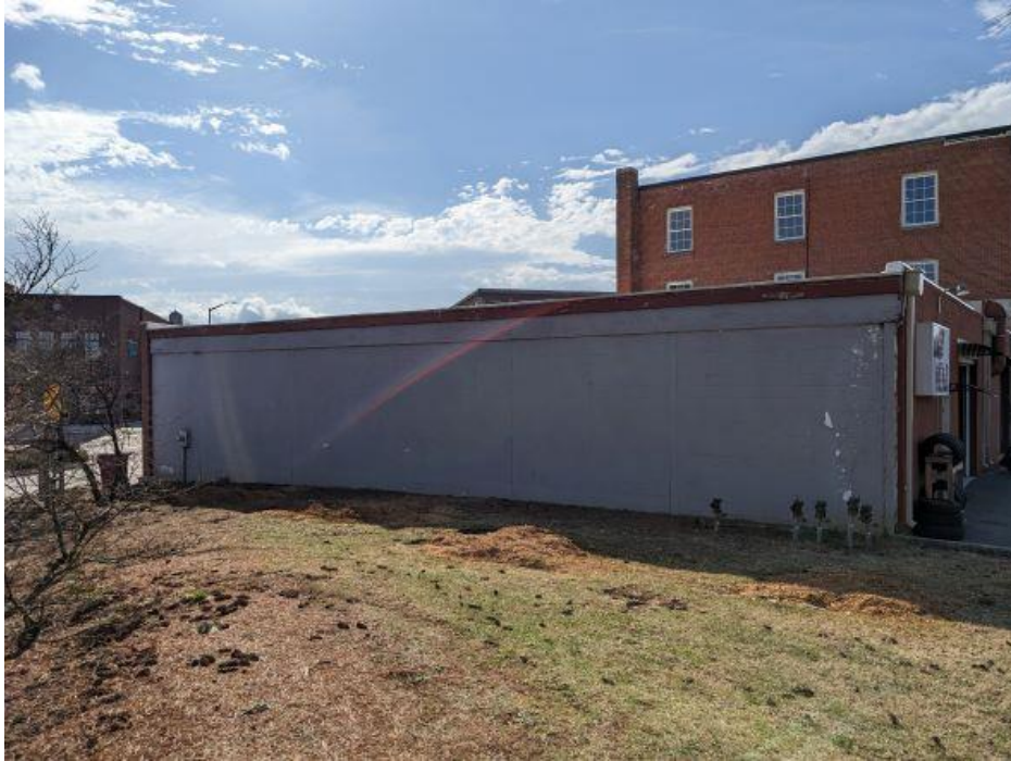
(Lower Wall Only)