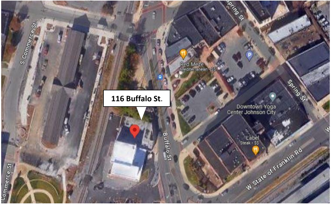
View the wall on Google street view: <a href="https://maps.app.goo.gl/hsZa3VTtezfDYTeH7">https://maps.app.goo.gl/hsZa3VTtezfDYTeH7</a> (The wall is nearly perpendicular to Buffalo Street and matches the gray wall depicted in the photos above)