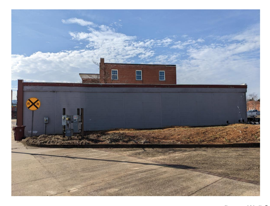
(Lower Wall Only)