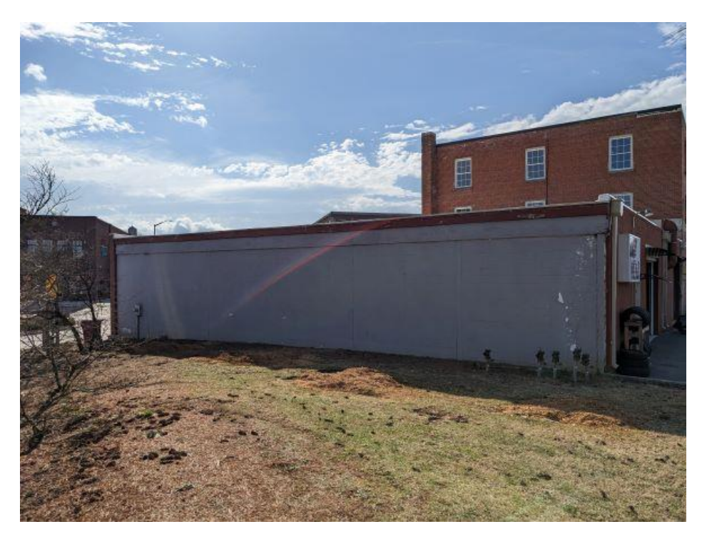
(Lower Wall Only)